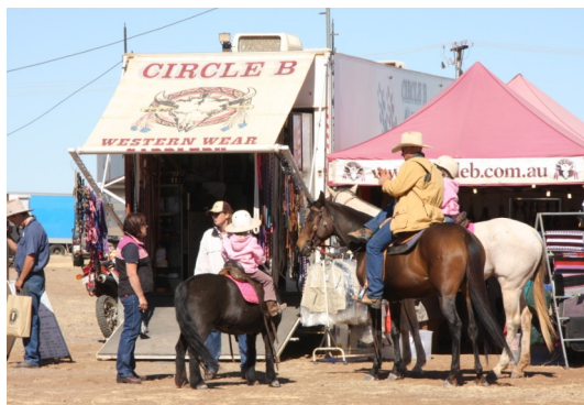
Circle B (proud sponsor) enjoying a busy day of trade at the 2009 Races

See the website www.abcraces.com.au for details, or contact Linda on 08 8972 1770.